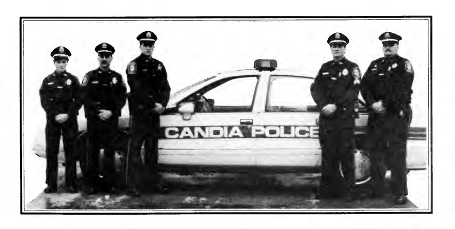
FOR THE YEAR ENDING DECEMBER 31, 1993

ANNUAL REPORT OF THE TOWN AND SCHOOL DISTRICT OF CANDIA New Hampshire