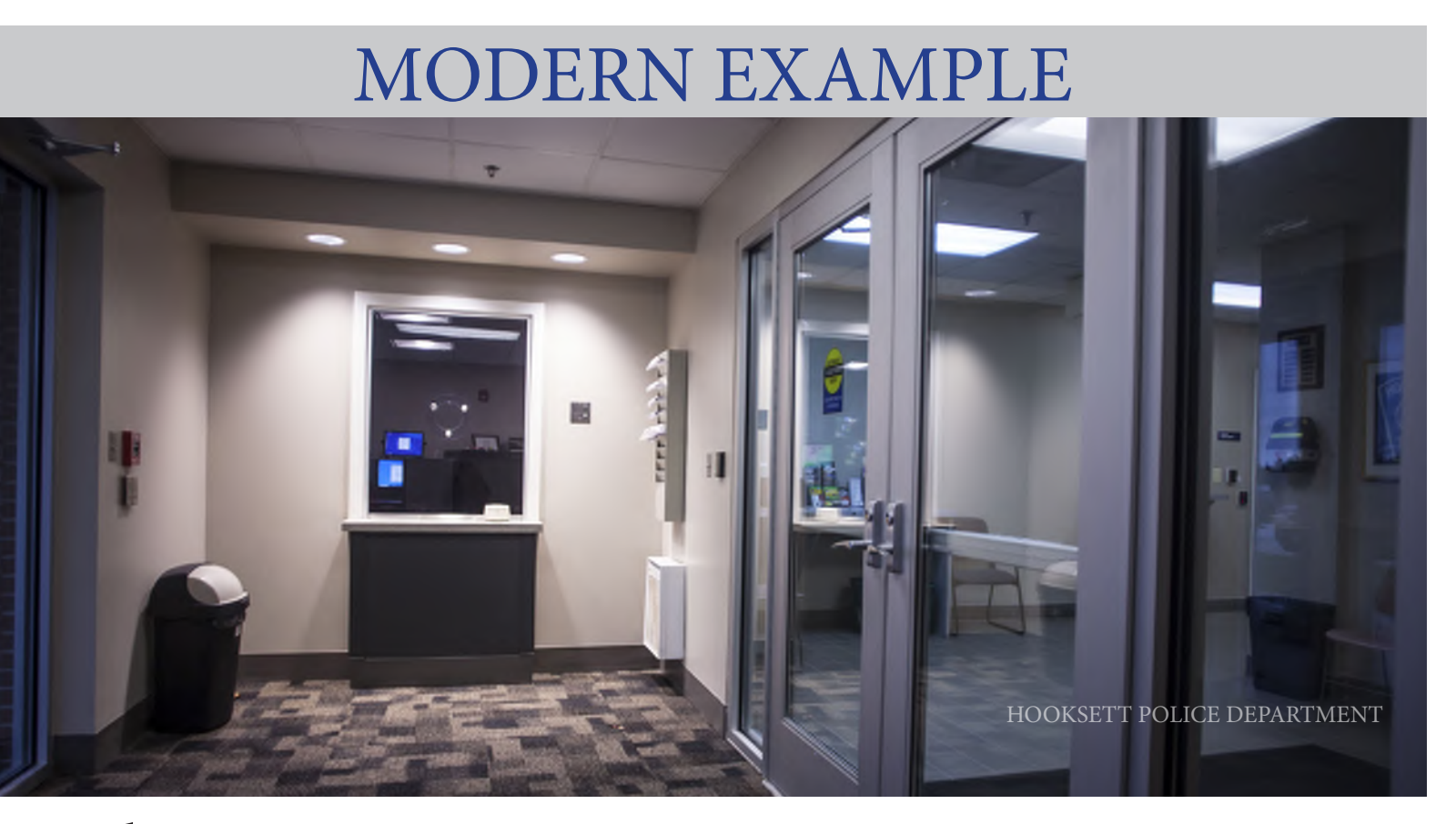
Shared public reception and prisoner entry Confined public waiting area Lack of separation and safety