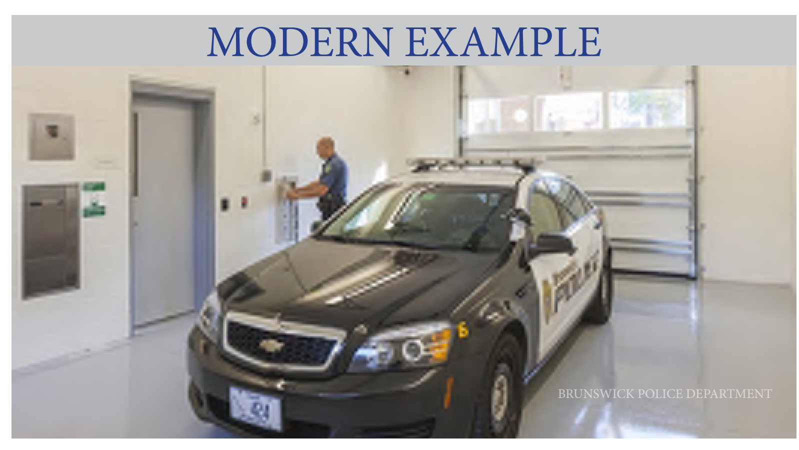
Current facility does not have a sally port and vehicles stay outside year-round Prisoners enter the facility through shared public entrance Safety and security risk during detainee transfer